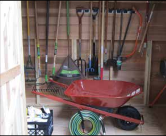
We have plenty of tools to borrow at the Shed. Check out our Garden Tool Lending Library at library.arlingtonva.us/shed .

Learn basic bicycle maintenance and how to make minor repairs yourself. Register for a 30 minute instruction session at arlingtonva.libcal.com/appointments .