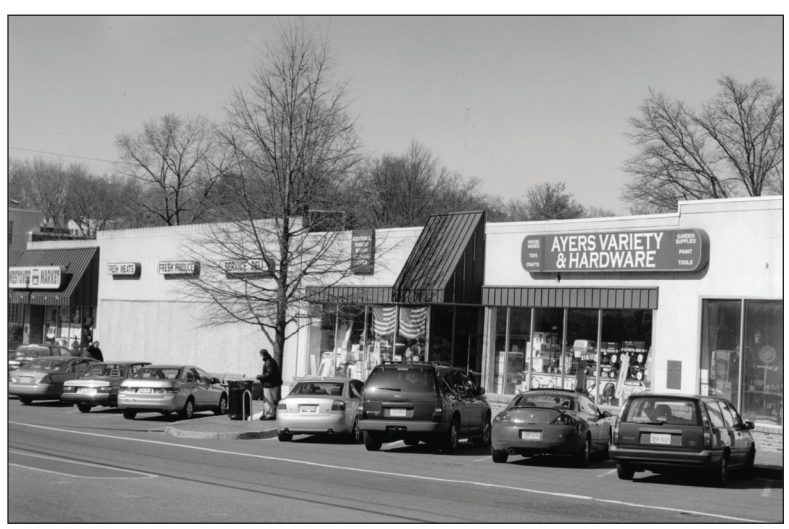
Ayer's Variety & Hardware, located at 5853 Washington Boulevard.