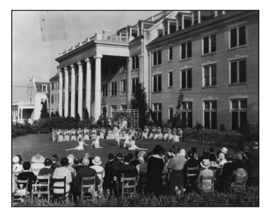
A May Day performance at Arlington Hall, ca. 1939.

Arlington's current "general store" would be Ayer's Variety & Hardware, in the Westover Shopping Center. It lives up to its name, with a huge variety of items for sale, like gift wrap, toys, screwdrivers, fans, pens, gardening supplies, measuring cups, and more.