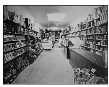
The Eisen family store, ca. 1930.